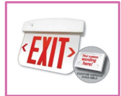
Thermoplastic LED Edgelit