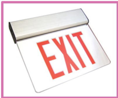
Aluminum Edgelit Exit Sign