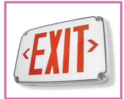
Compact Wet Location