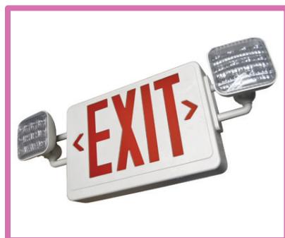
Exits & Emergency Combo