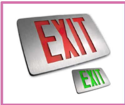
Thin Die Cast